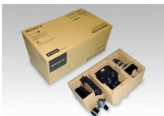
〔Corrugated cushioning for video camera.〕

Resource saving, Reduction in the number of parts, and High-performance product protection. This corrugated cushioning for video camera has various characters. The layout of the cushioning for the main body and its attachments is designed to look good when opened. This cushioning also delivers high-performance product protection. Furthermore, it has saved resource through the reduction of corrugated consumption.